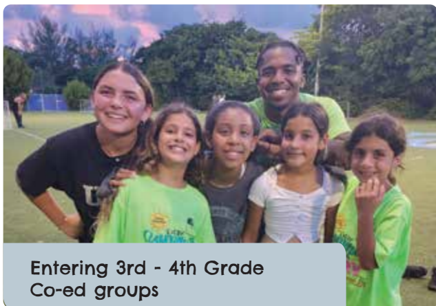
Entering 3rd - 4th Grade Co-ed groups