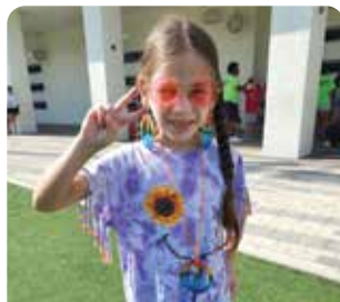
Dress Up Days