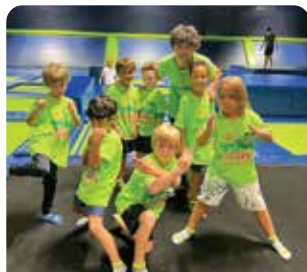
Select Field Trips