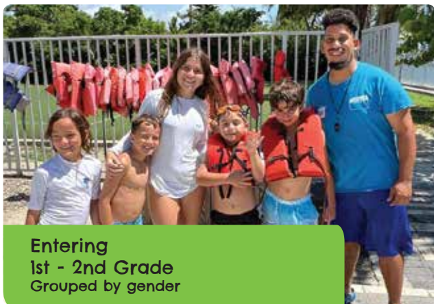
Entering 1st - 2nd Grade Grouped by gender