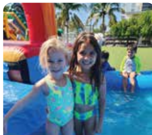
Water Fun Days