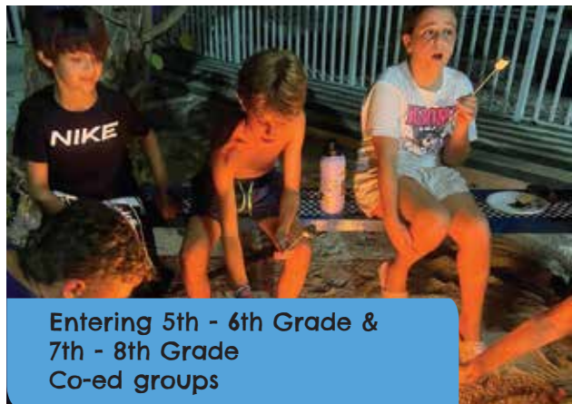
Entering 5th - 6th Grade & 7th - 8th Grade Co-ed groups