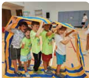
Boker Tov Morning Dances & Games