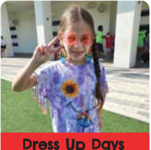
Dress Up Days