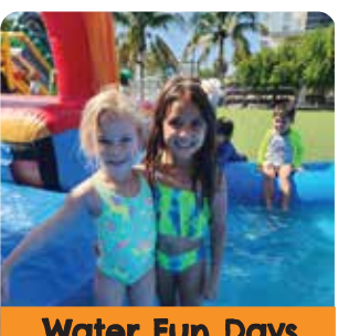
Water Fun Days